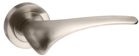
Product Finish Pictured: Satin Nickel